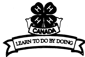
The 4-H Clubs

1st: $4.00; 2nd: $3.50; 3rd: $3.00; 4th $2.50